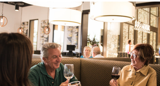
JUNE HILL'S TABLE Feature Restaurant

The Polo Club is a private, non-equity club which delivers its members an experience unlike any other, and includes all of the following amenities and more. The Social Membership is the premier class of membership, and available to residents of Trilogy at The Polo Club.