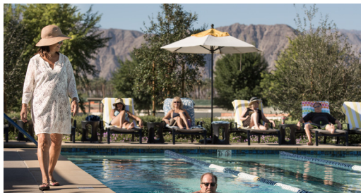
RESORT, LAP & FITNESS POOLS