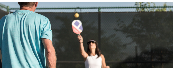
TENNIS & PICKLEBALL COURTS