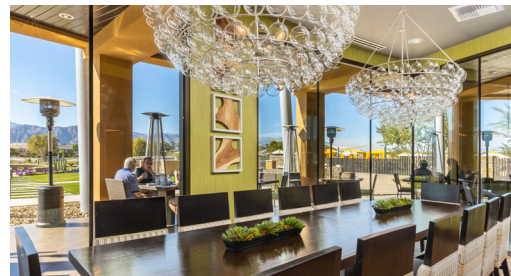
THE COUVERIE Private Dining