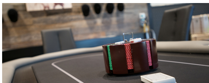
GAME & CARD ROOMS