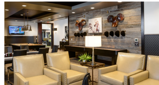
MEETING & MULTI-PURPOSE ROOMS