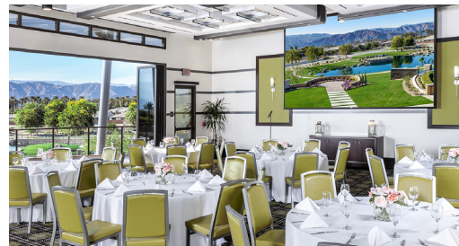
2PALMS EVENTS CENTER