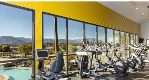
THE FLOW STRENGTH & MOVEMENT Fitness Center