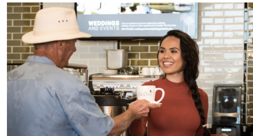
THE MARKET PLACE Grab & Go Market and Retail