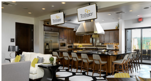
MCCARROLL'S KITCHEN Interactive Teaching Kitchen