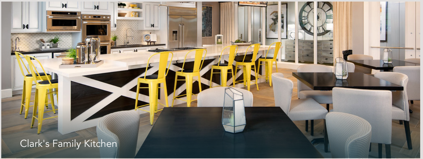
Clark's Family Kitchen