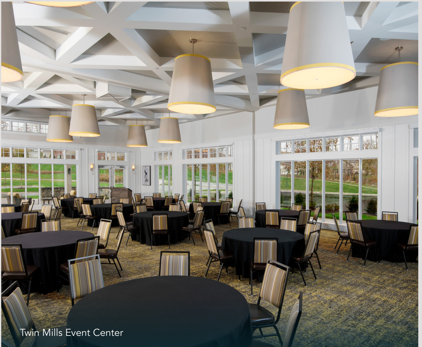
Twin Mills Event Center